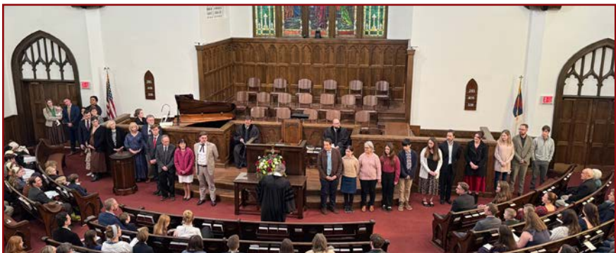
New Members introduced to the SPC Family, Sunday, December 1